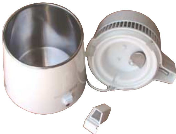
The Lift-Off Top Provides Easy Access into the Seamless, Stainless Steel Boiler